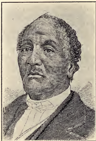
BISHOP WILLIAM PAUL QUINN